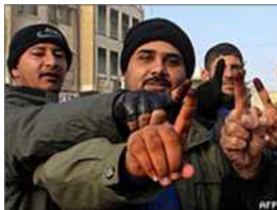
Voters have to dip their finger in ink to guard against multiple voting