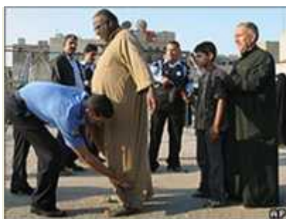
In pictures: Iraq election

“ It is a moral victory for the exploited Iraqis and a big victory for human liberty ”